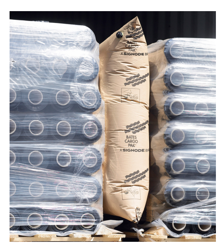
Flex Eco inflated in position