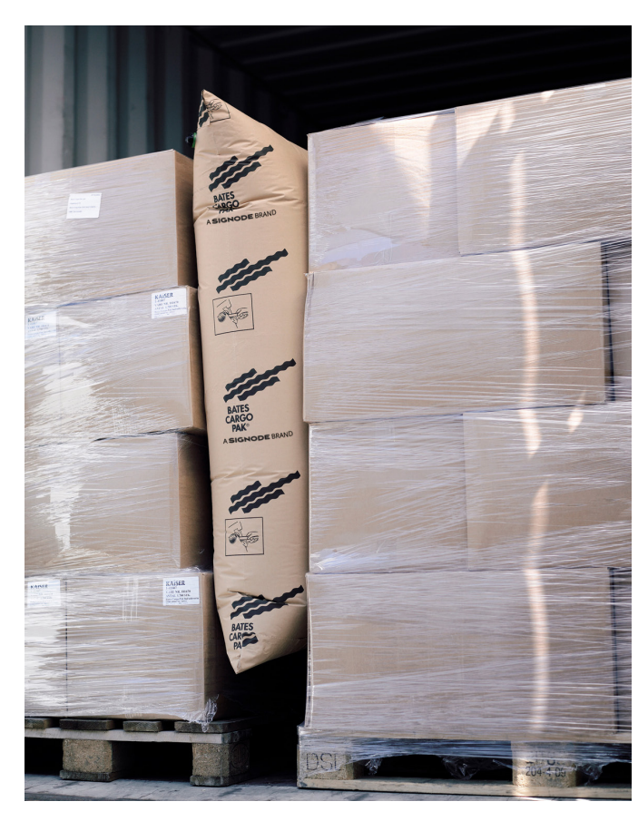
Flex Eco inflated in position

materials. High wet strength due to the choice of materials and composition. Can withstand up to 90% relative humidity (RH) at 60°C.