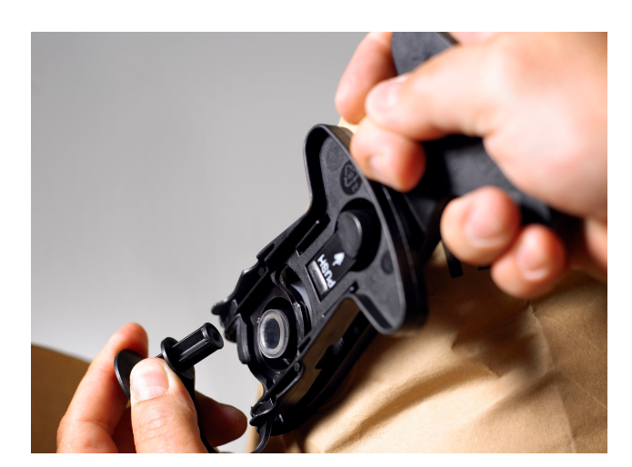
Reusable valve system