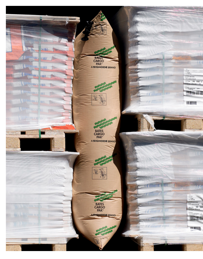
Reuse airbag inflated in position